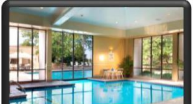
Indoor/Outdoor Heated Pool