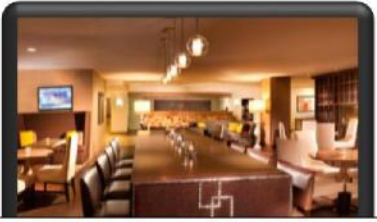
Restaurant & Bar

The recently renovated Omaha Marriott is located approximately 8 miles from the Nebraska-Iowa border. The hotel has two wings, with 4 floors in one wing and 6 floors in the other. There are 300 guest rooms and 3 elevators. No stairs are required to get anywhere. Wherever there are stairs, there is a ramp next to it. The restaurant is open for breakfast and dinner and there is a full onsite bar.